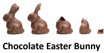
Chocolate Easter Bunny